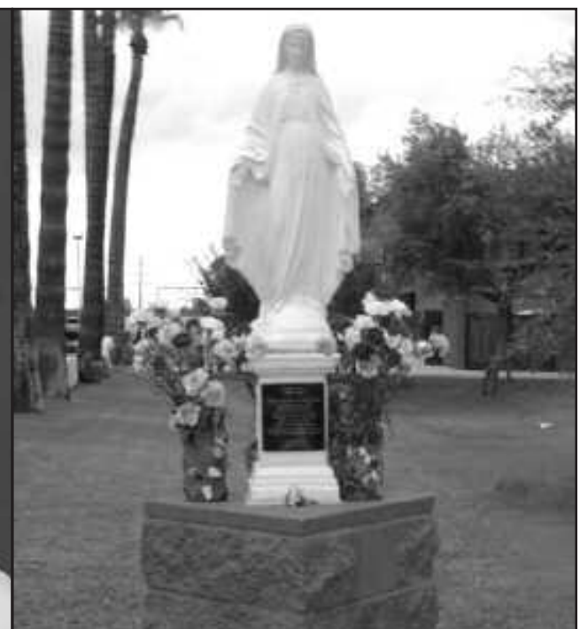
The statue of Mary covered with flowers after Seniors had the pleasure of honoring our Mother